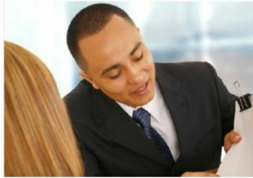
ISO 9001 Internal Auditor

One-Day ISO 9001 Basics 101 April 3 only $275.00 Click here