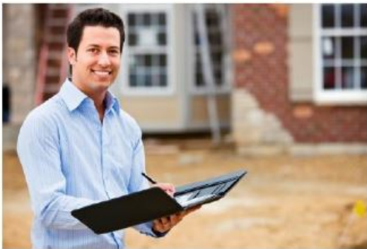
ISO 9001 Basics 101

Select your class and select your participant offer