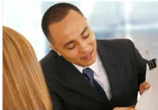
ISO 9001 Internal Auditor

Don't miss out! Check out the special pricing on our summer ISO 9001:2015 Classes running August 14-15. Registration link below