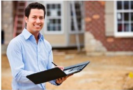
ISO 9001 Basics 101

Select your class and select your participant offer